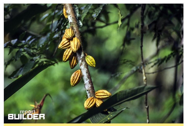
This cocoa plant's fruit is used to make chocolate.