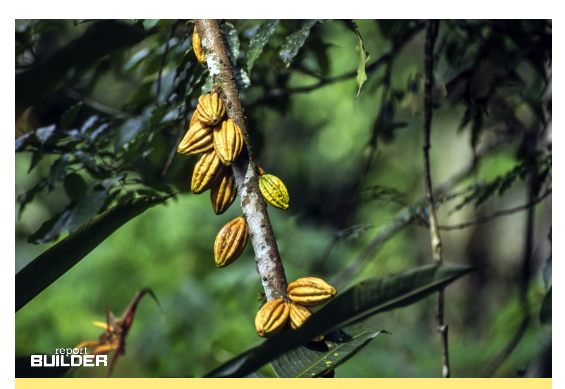
This cocoa plant's fruit is used to make chocolate.