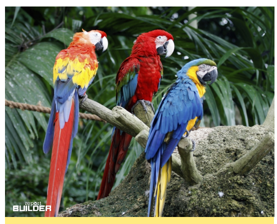
Bright macaws sit in the plush trees of the rainforest.