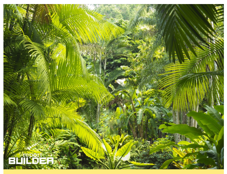
Warm, wet forests can be called jungles or rainforests.