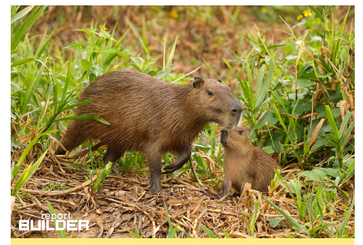
The largest type of rodent, called the capybara, lives in the rainforest.