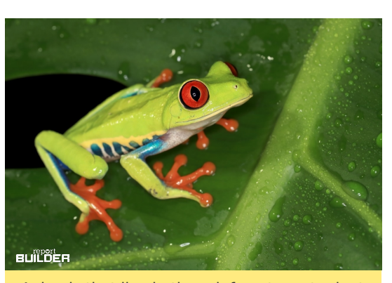
Animals that live in the rainforest must adapt to being warm and wet most of the time.