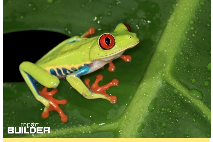
Animals that live in the rainforest must adapt to being warm and wet most of the time.