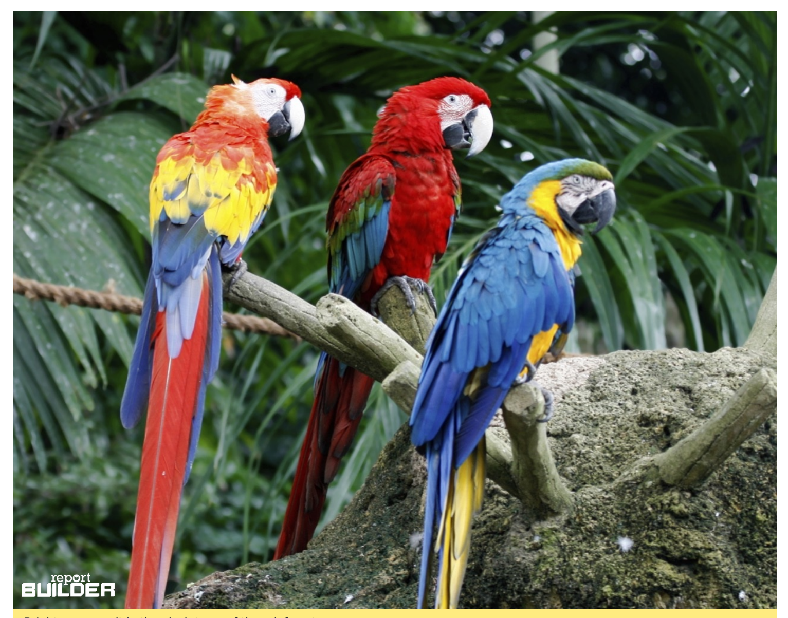
Bright macaws sit in the plush trees of the rainforest.