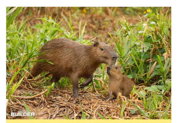
The largest type of rodent, called the capybara, lives in the rainforest.