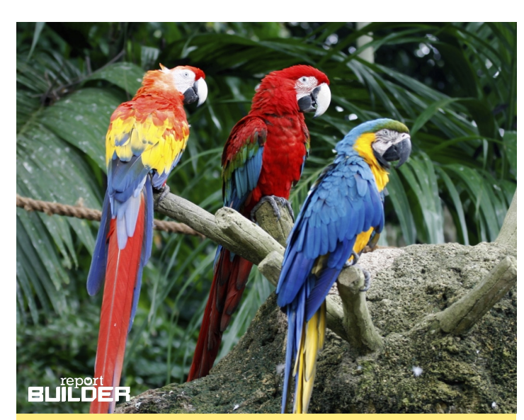
Bright macaws sit in the plush trees of the rainforest.