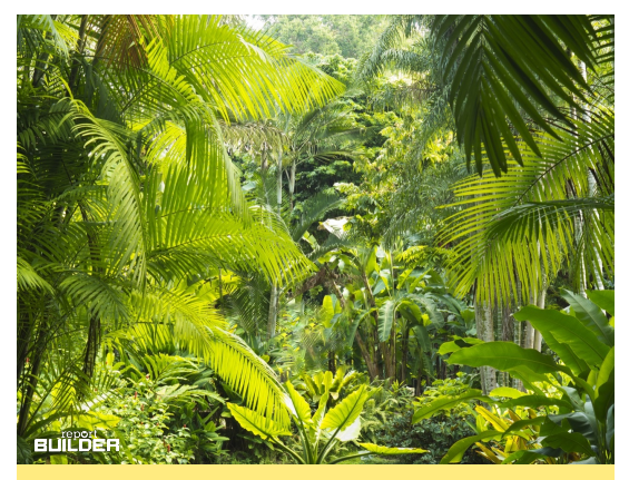
Warm, wet forests can be called jungles or rainforests.

Many rainforest plants are used to make medicines.