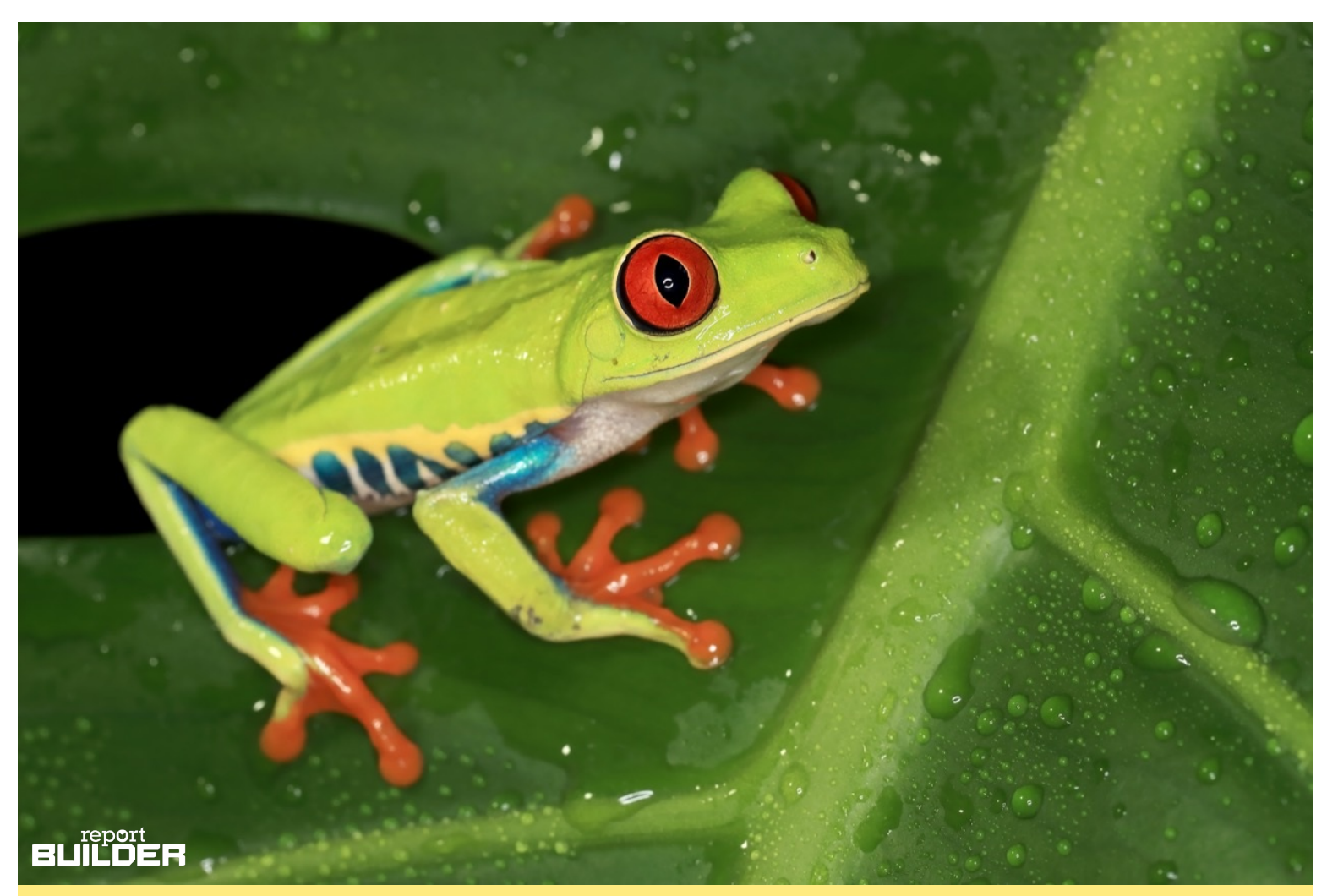
Animals that live in the rainforest must adapt to being warm and wet most of the time.